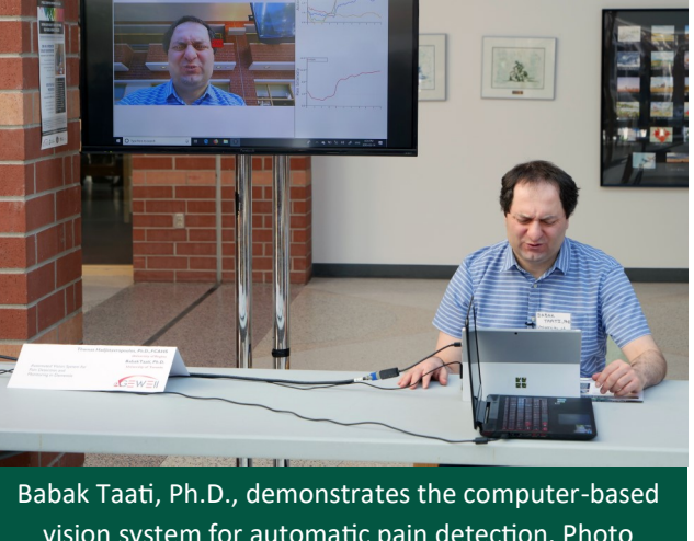
vision system for automatic pain detection.

Thomas.hadjistavropoulos@uregina.ca or babak.taati@uregina.ca