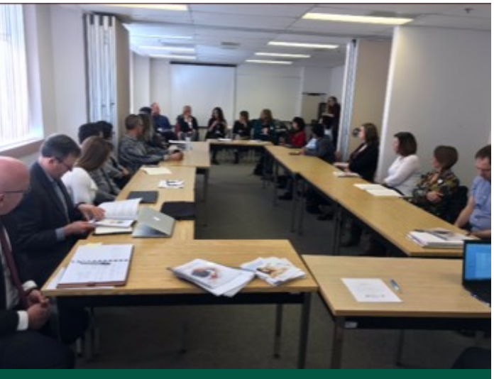
AGE-WELL researchers meet with directors of long-term care from the Saskatchewan Health Authority.